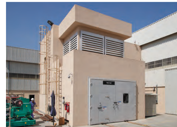
Genset Load test upto 2,500 KVA, 415V @pf 0.8 or 1.0