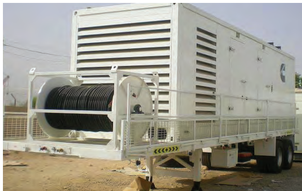
Mobile Power Pack. 1 MW supplied to RAECO. Multiple units were supplied. Each can parallel with utility or any other generator and run on Load Govern mode.