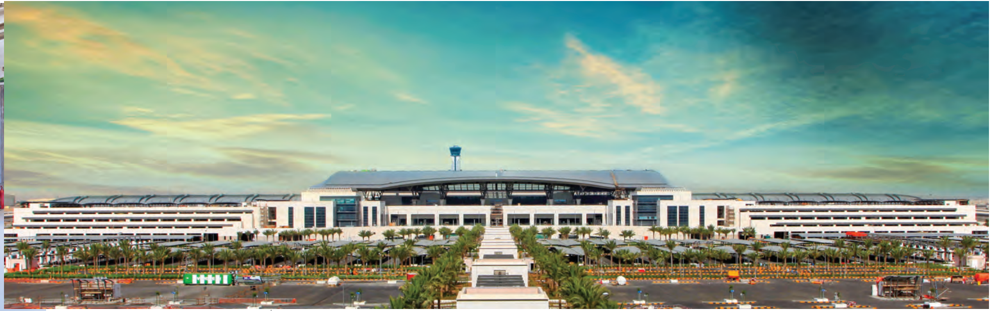
40 MVA Standby Power at Muscat International Airport and Salalah Airport.