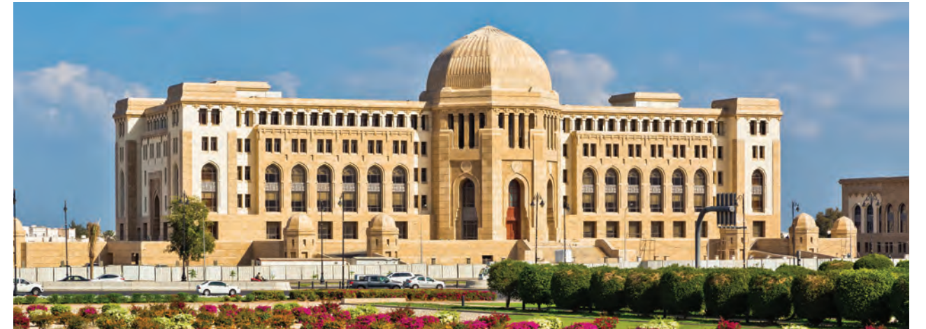
Standby Power at Supreme Court building