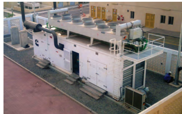
Backup generator with Fire detection and suppression system thermostatic controlled cooling system and complex utility changeover control with bump less restoration at PDO Mina Al Fahal.