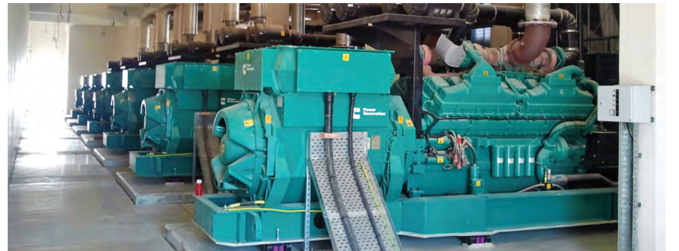
6 nos. 2500 kVA, 11 kV generator with automatic load management and with bump less restoration at RGO complex