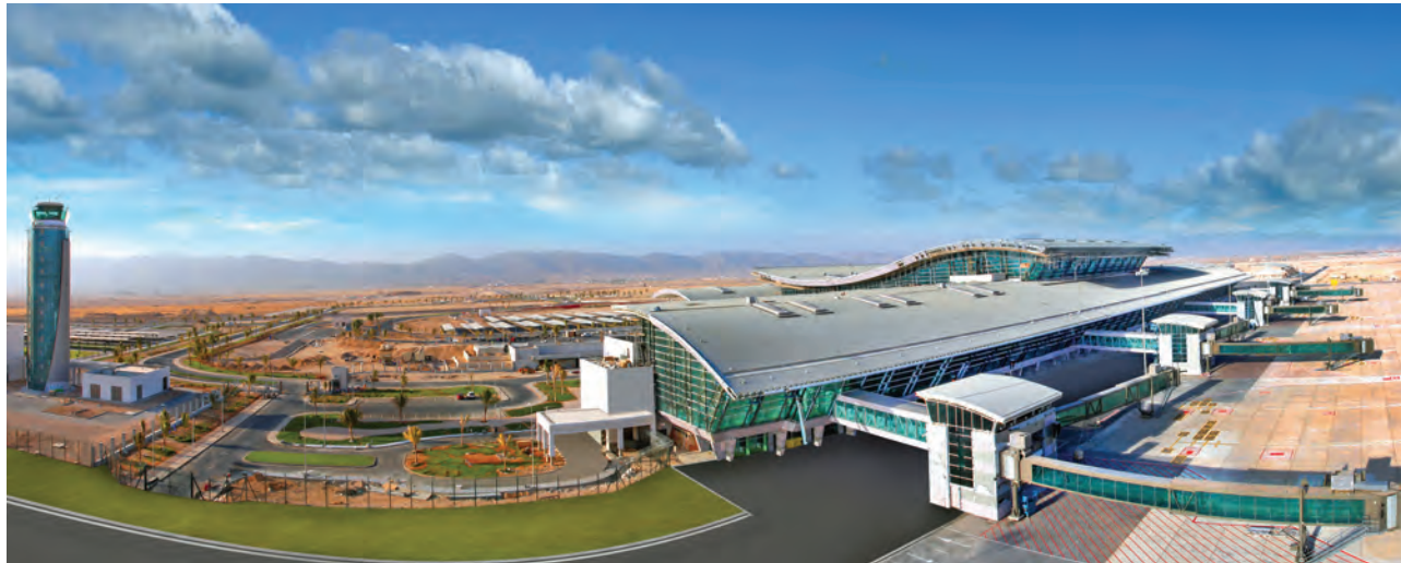
Standby Power at Salalah Airport.