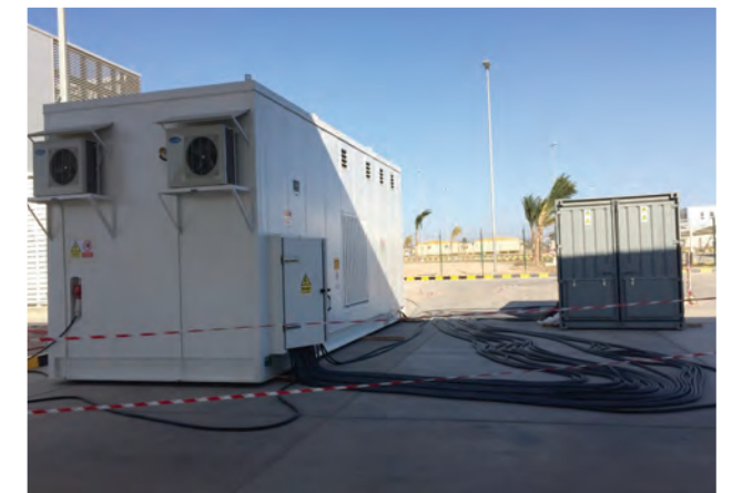
Insitu Genset Load test upto 3,500 KVA, 415V /11KV / 6.6KV @pf 0.8 or 1.0