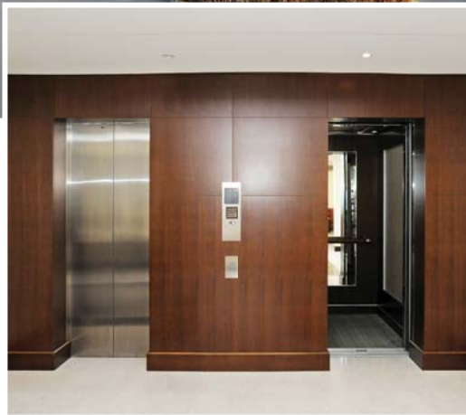
Below Largest transport system including 26 Elevators, 8 Escalators & 8 Trav-o-lators at Tilal Complex, Al Khuwair