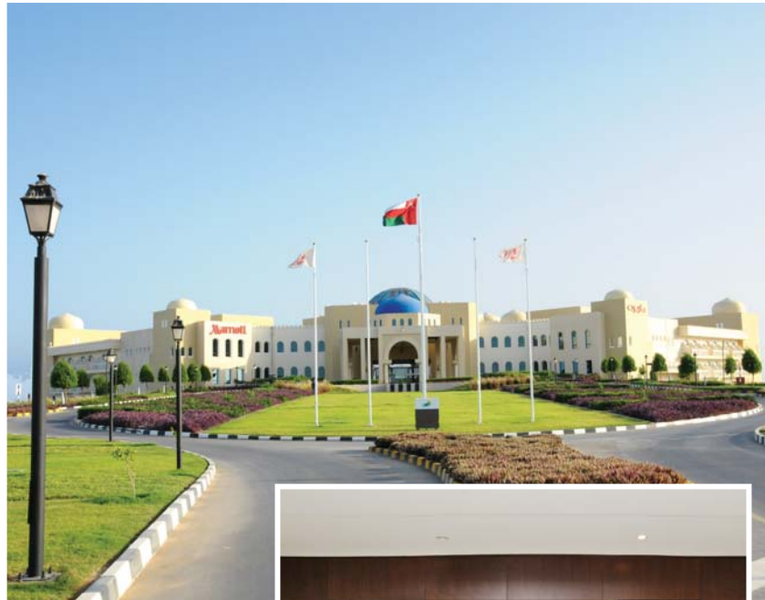
Top & Right Installation of 8 Elevators at Salah Marriott Resort

Experienced and skilled maintenance service technicians keep vigil over a vast network of installations throughout the Sultanate (zoning system), 24 hours a day ensuring safe and trouble free operations of each installation.