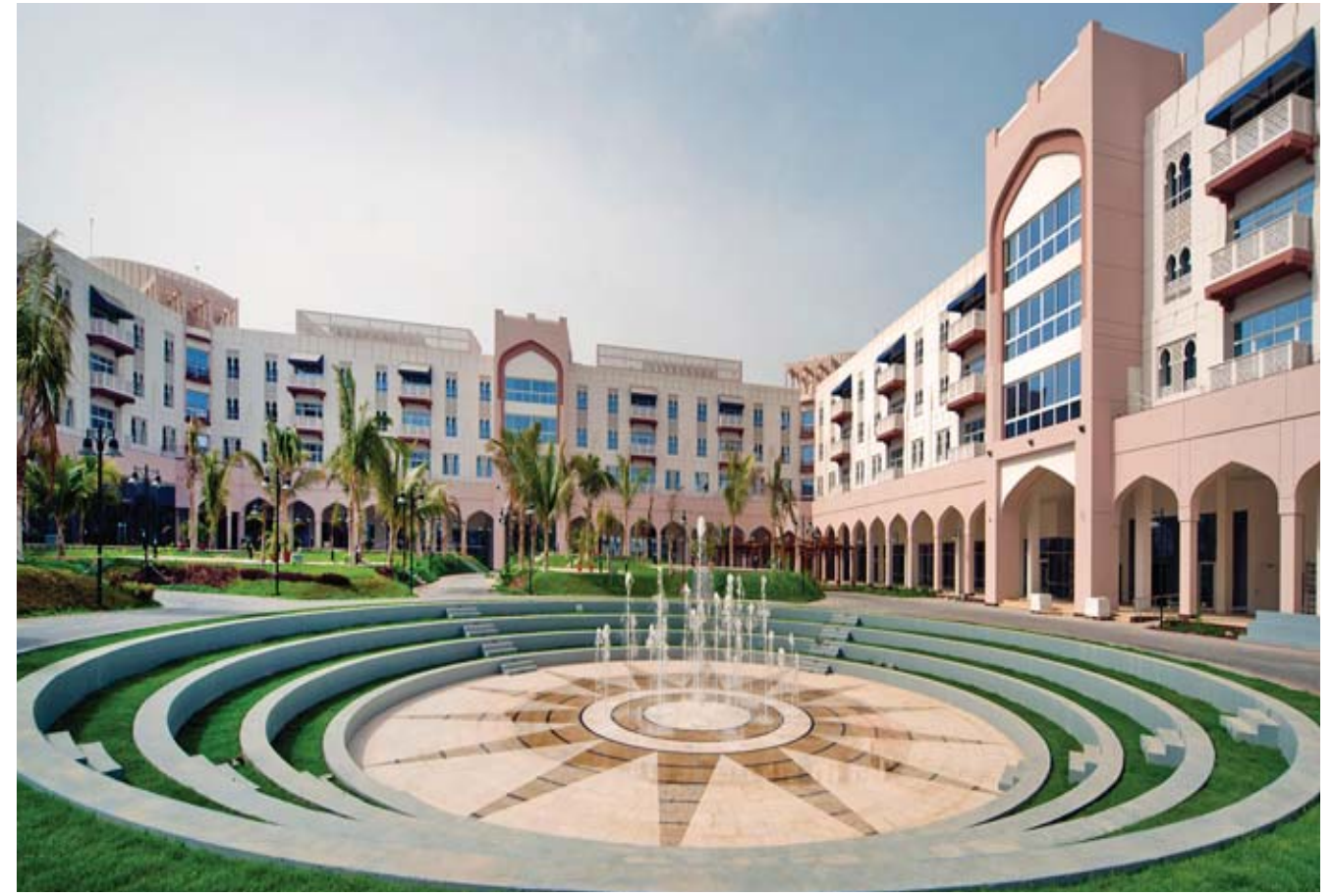
22 Elevators 4 Escalators 2 Travolators at Salah Touristic Complex