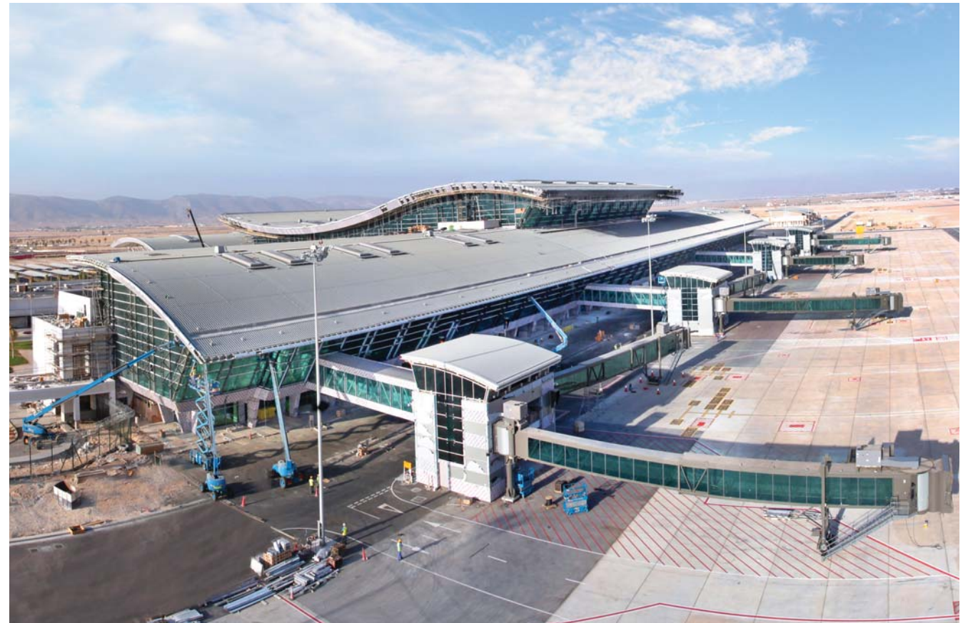
36 Elevators and 14 Escalators in Salah Airport

The division has an exclusive Quality Control Programme that covers all their local activities like delivery, installation, modification etc. and has been accredited with ISO 9001-2008 Certification.