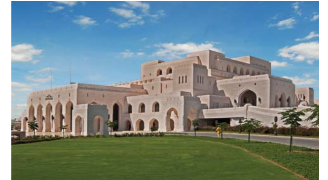
13 Elevators and 2 Escalators at Royal Opera House, Qurum