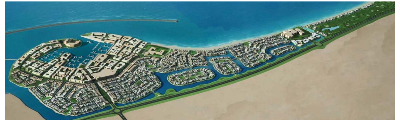
292 Elevators in Phases at The Wave Muscat