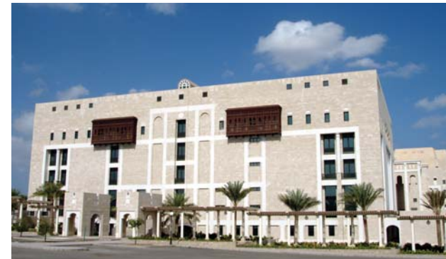
13 Elevators at Sultan Qaboos University Cultural Centre