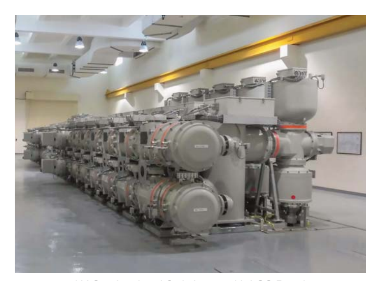
132kV Gas Insulated Switchgear with LCC Panels at Mahadha 132kV Grid Station.