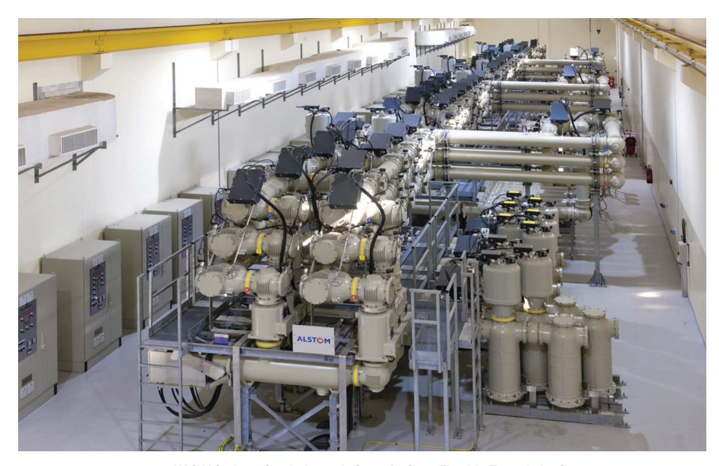
220 kV Grid Station at Sur, the largest in Oman, for Oman Electricity Transmission Company.