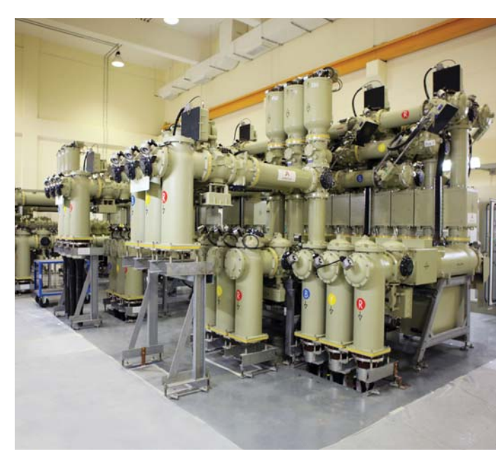
132 kV GIS at Al Quoz substation - DEWA