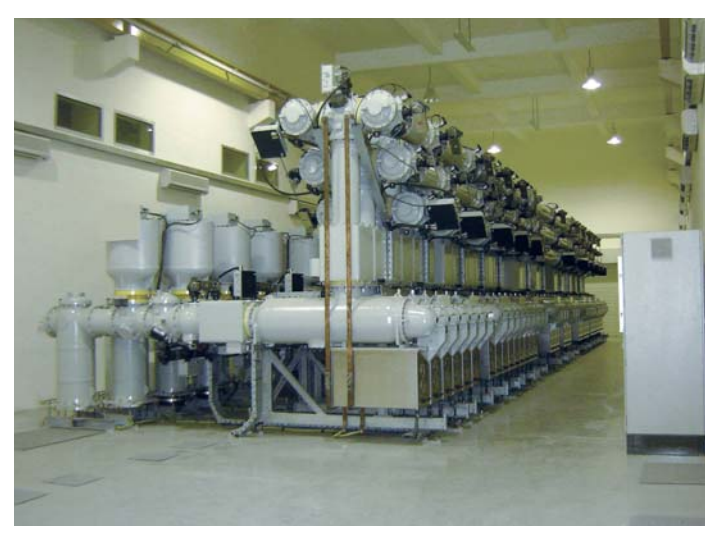
220 kV GIS at Sohar Power Station Sub-station