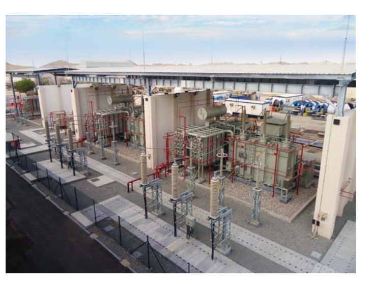
Construction of 132/33kV Grid Station at Rusail for OETC