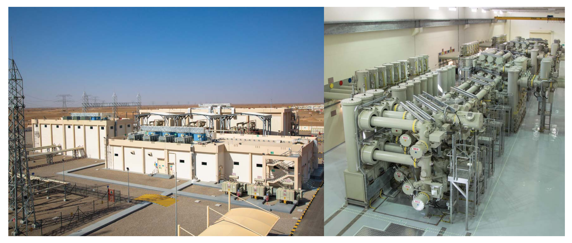
400kV GIS – 17 Bays with Bus Duct, 3x500MVA Transformers for New 400/220kV IPP Grid station at Ibri, Oman

Acceptance of challenges and setting new standards in terms of Project Completion has been a hallmark of the operations of the division. This has been demonstrated in the timely completion of EPC projects like 220 kV Barka Transmission System (first 220kV in Oman), 220kV Sohar Transmission system, 220kV Sur Substation etc. The Division has also successfully executed 17 Nos of 132/11kV Substations on EPC basis at Dubai directly with DEWA and through developers.