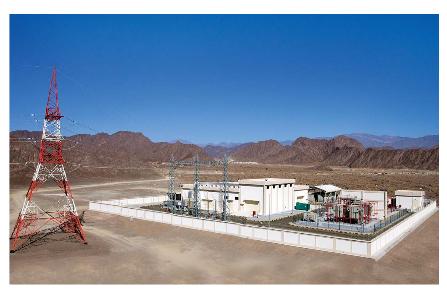
132/33 kV Grid Station - Madinat Nizwa