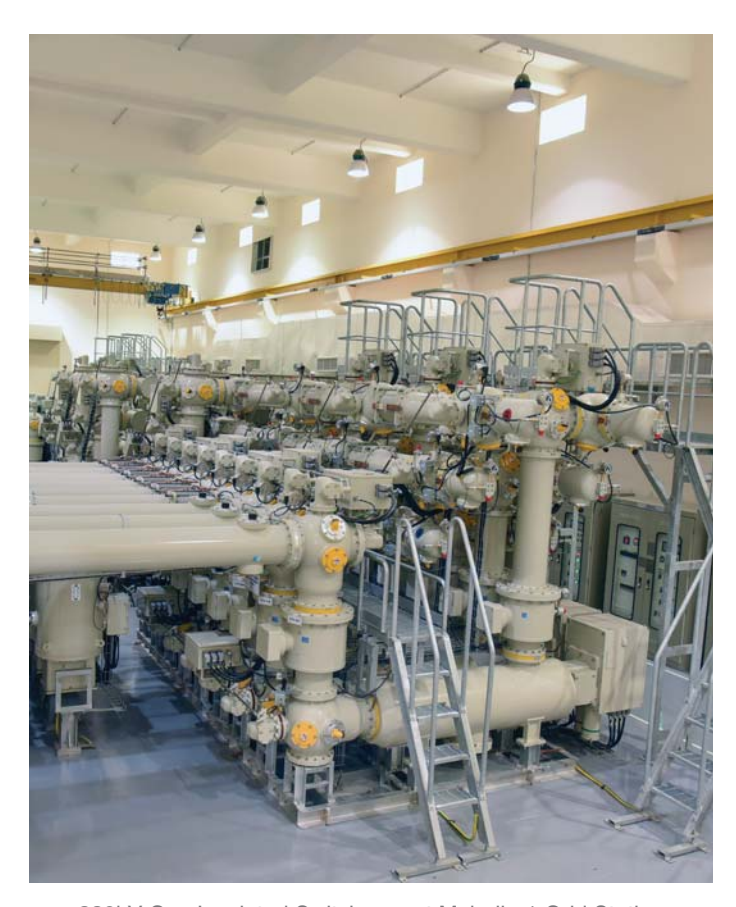
220kV Gas Insulated Switchgear at Mabella-1 Grid Station