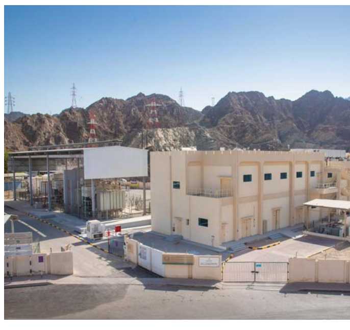
132/33kV Grid Station at Wadi Kabir