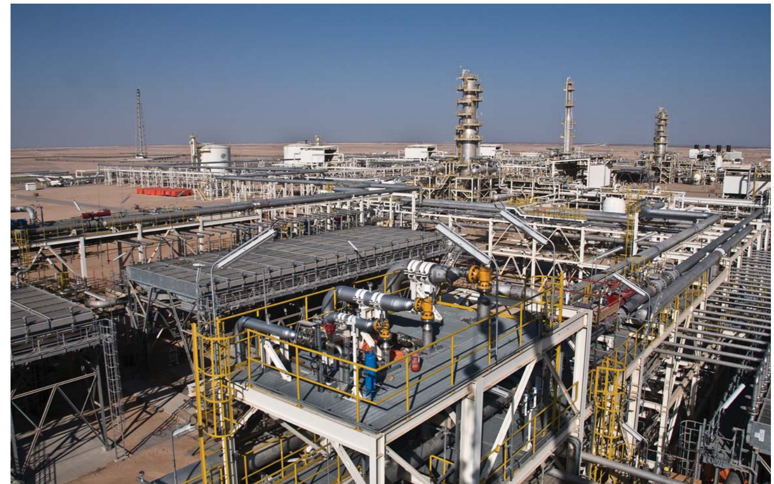
A view from the Pipe Rack