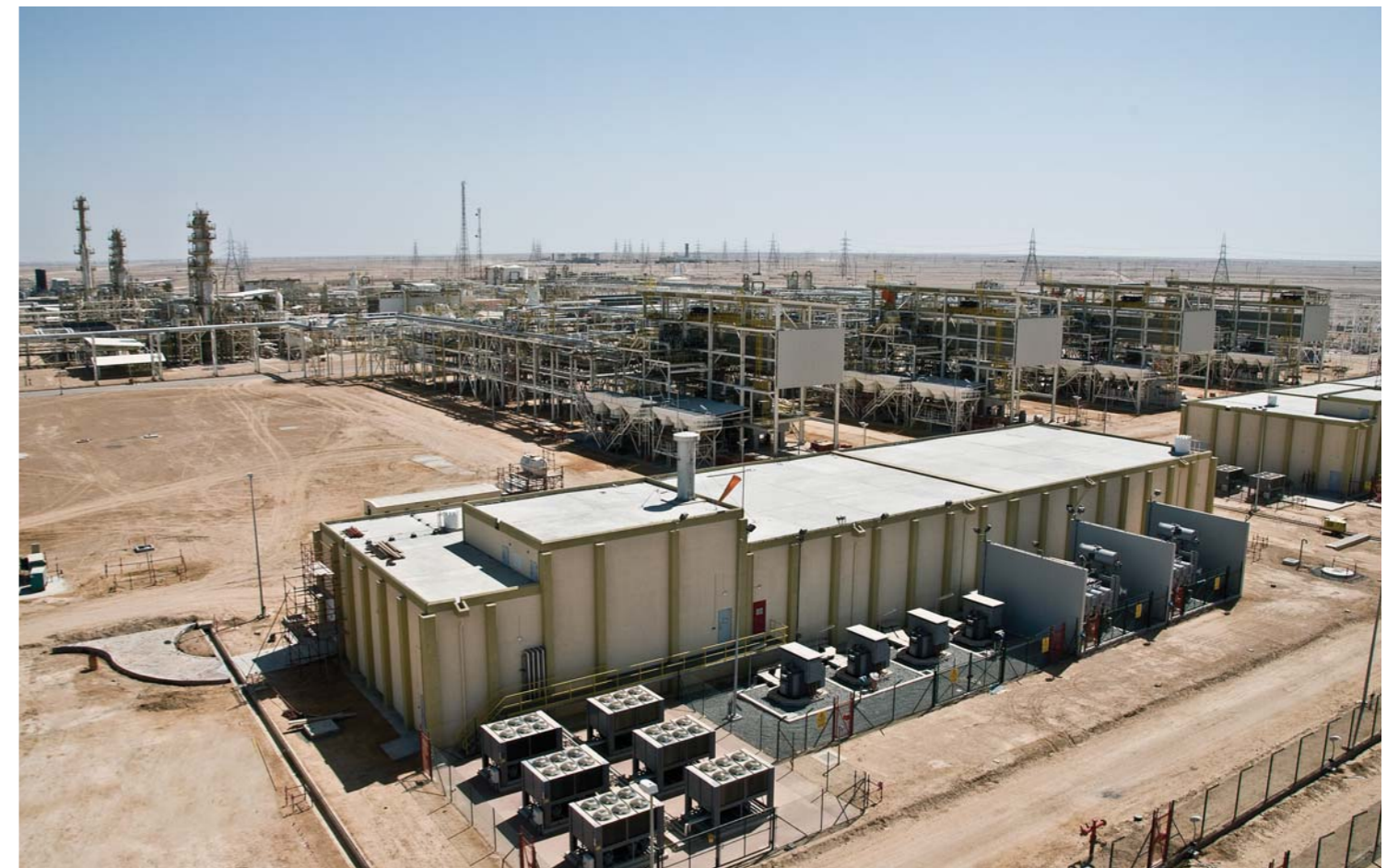
Aerial view of Compression Plant